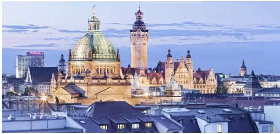
Come to Leipzig to discuss Hegel