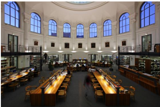
The course will take place in the beautiful "Albertina."